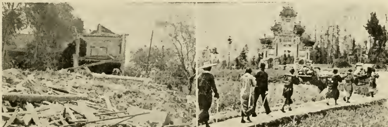
(Left) Ruins of Chungking High School; (right) students' trek to West China

As we consider the institutions and forms of service which have constituted our program in these lands in the past, we feel that they all are good and will go on into the future in adapted forms and under native leadership. But out of every one of them there emerges enlarged opportunities for a greater, more comprehensive service to those parts of the population as yet unchristianized. This means a new cycle in missions. It means turning over the institutions to native leadership and undertaking new forms of service. It means going out to people in the villages and countryside who have not yet realized the love of the Father, nor experienced the abundant life he has for all his children. It means personal service of the kind that the first missionaries gave. All this means new missionaries, of creative ability, deep consecration, hardy physique, and in just as great numbers as can be found. We shall need doctors and nurses, social-service workers, ministers, kindergartners, religious education experts, economists and agriculturalists, and people interested in literacy and the production of literature. So we throw down the challenge to Christian youth to give careful consideration to the great opportunities of service in Japan and Korea as we approach the New Age in Christian Missions.